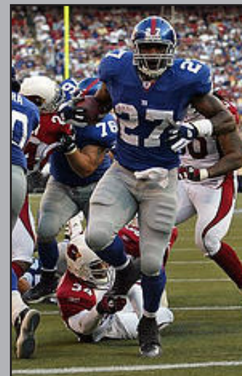
SIU's Brandon Jacobs, here with the New York Giants, was the league's Newcomer of the Year in 2004.