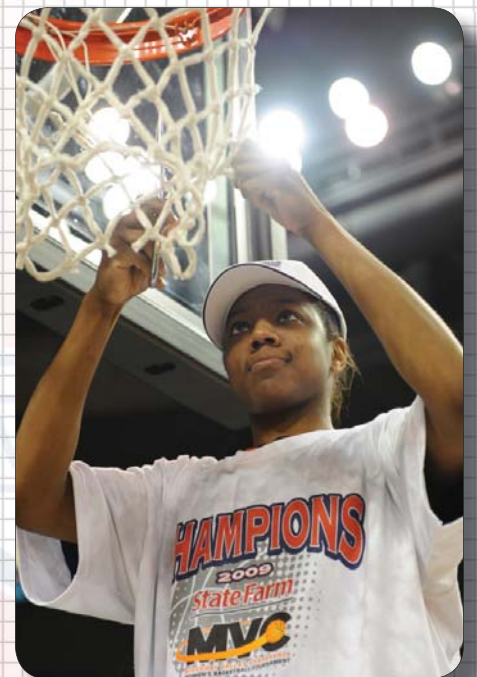
Evansville topped Creighton in the 2009 State Farm MVC Women's Basketball Tournament championship, putting the finishing touches on its magical post-season run.